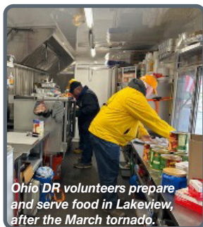
Ohio DR volunteers prepare and serve food in Lakeview, after the March tornado.

Please pray for God to continue to use our church to glorify him, equip the saints, provide fellowship opportunities for the saints, and reach the lost.