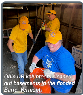
Ohio DR volunteers cleaned out basements in the flooded Barre, Vermont.