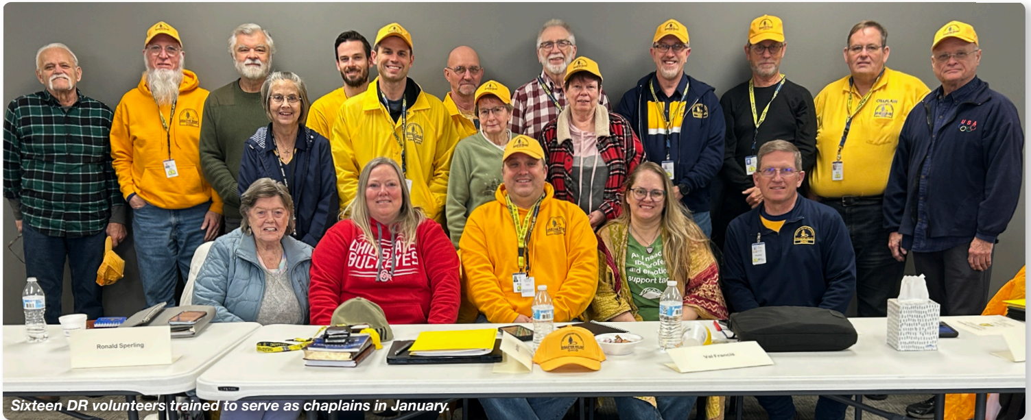
Sixteen DR volunteers trained to serve as chaplains in January.