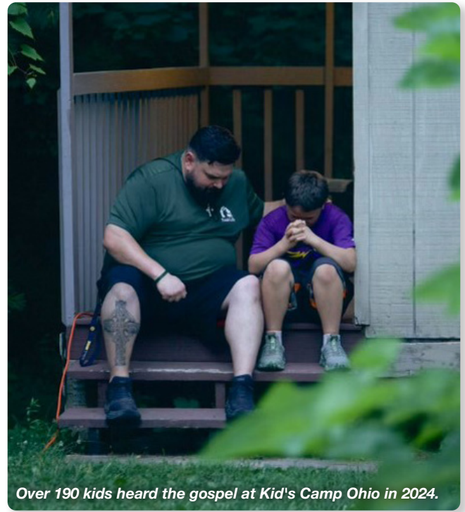
Over 190 kids heard the gospel at Kid's Camp Ohio in 2024.

Editor's Note - SCBO provided grants for the 2024 Kid's Camp and the 2024 Youth Camp from Evangelism Grant Funds.