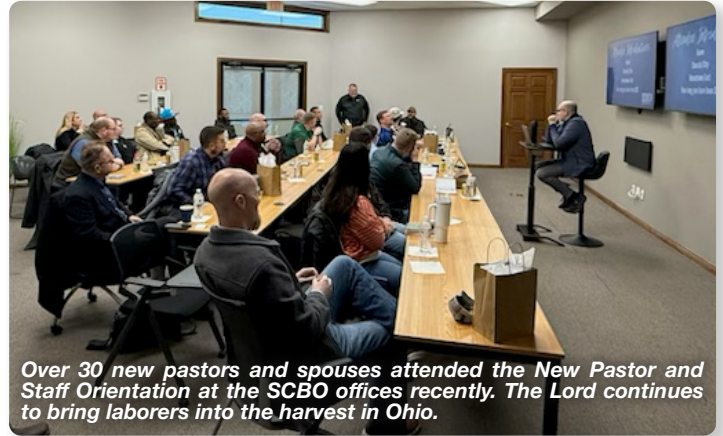
Over 30 new pastors and spouses attended the New Pastor and Staff Orientation at the SCBO offices recently. The Lord continues to bring laborers into the harvest in Ohio.

What a blessing, but an even greater reminder that what Jesus said over two thousand years ago is still true to-