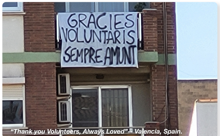
"Thank you Volunteers, Always Loved" - Valencia, Spain.

Disaster Relief is about the people we meet and the hope of Jesus we get to share with them.