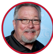
Ted DiBiase Retired Pro-Wrestler, “The Million Dollar Man”