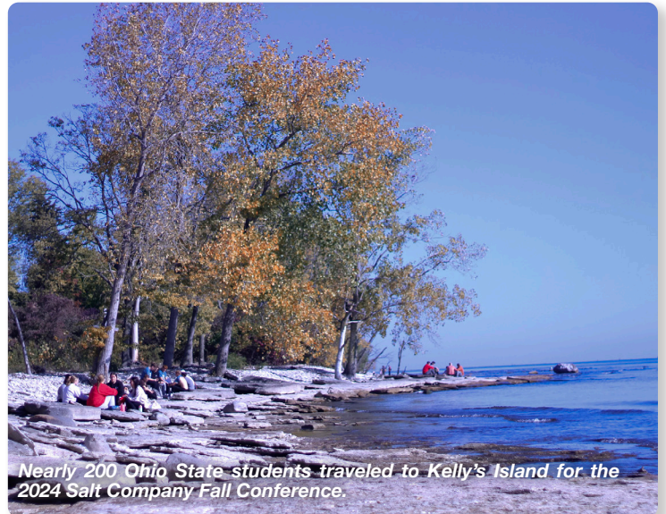
Nearly 200 Ohio State students traveled to Kelly's Island for the 2024 Salt Company Fall Conference.