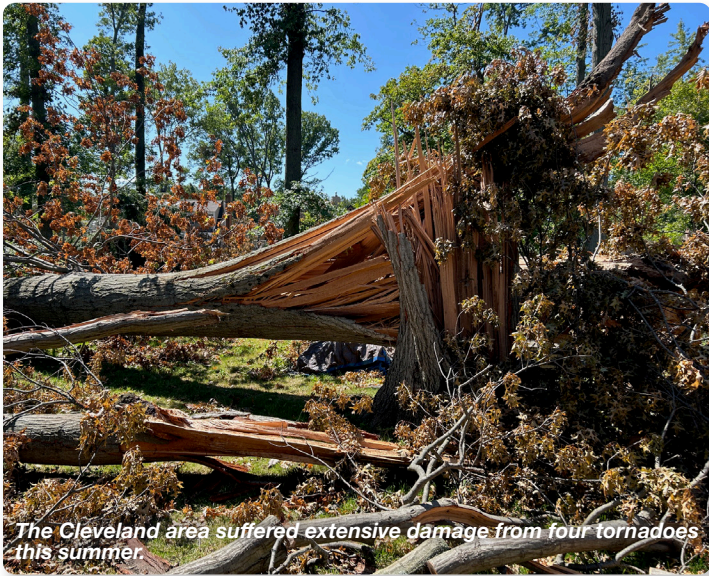
The Cleveland area suffered extensive damage from four tornadoes this summer.

However, the value of Disaster Relief is worth much more to the people DR helps.