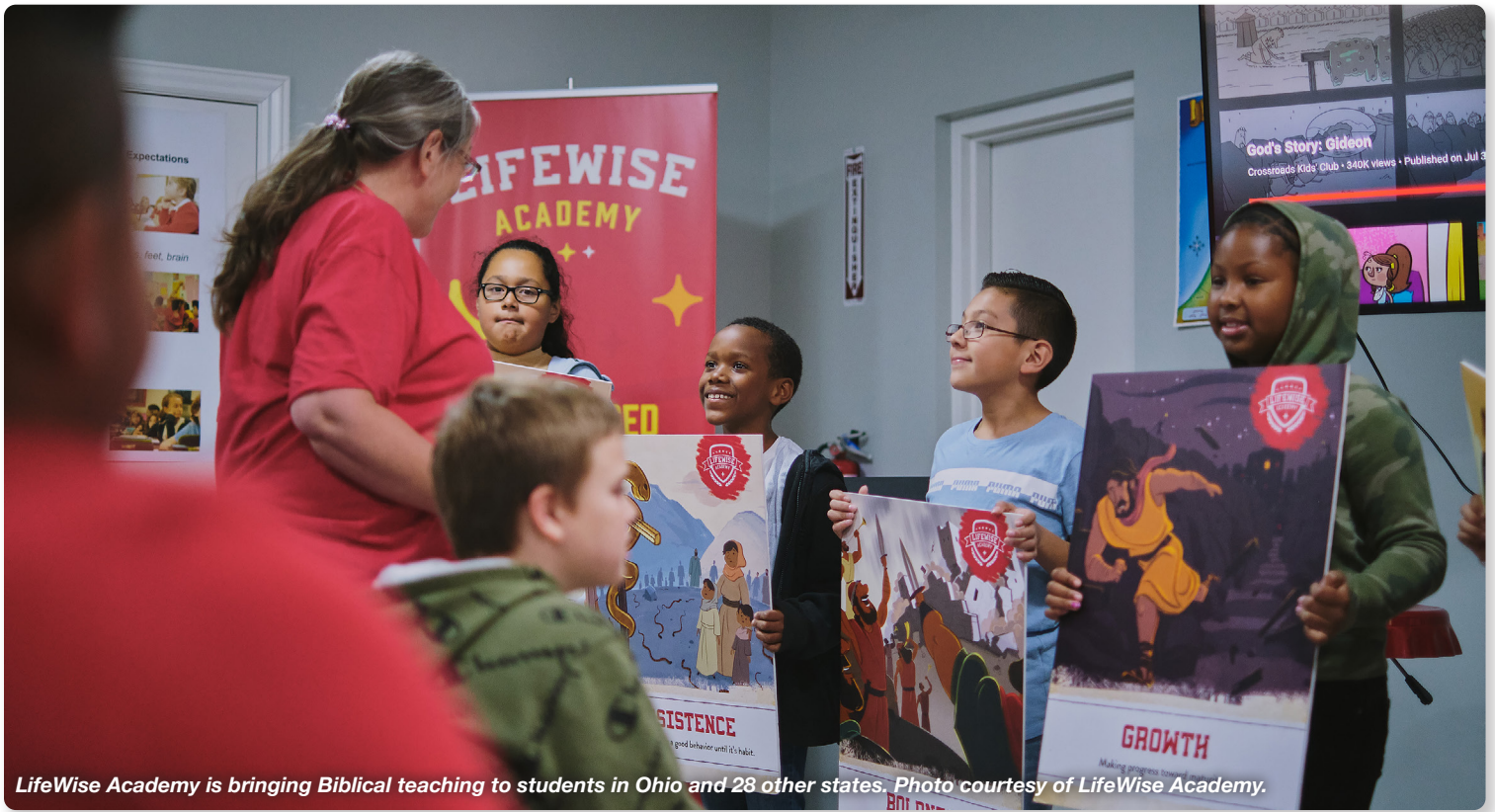
LifeWise Academy is bringing Biblical teaching to students in Ohio and 28 other states.