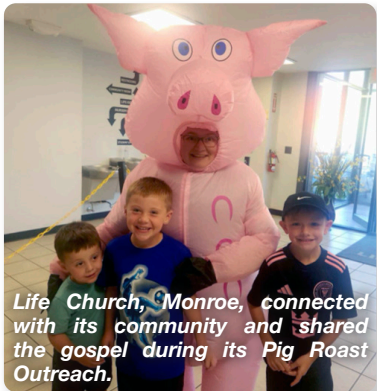
Life Church, Monroe, connected with its community and shared the gospel during its Pig Roast Outreach.

The Life Church Pig Roast on August 24 in Monroe, was a tremendous success, aiming to connect with neighbors and friends through a fun and welcoming event. Alongside great food and fellowship, members of our congregation who have been training in the 3 Circles evangelism method actively shared the gospel with visitors. We were thrilled to feed over 200 people and minister to many in our community. Additionally, leftover food was donated to a local ministry, further extending the event's impact. We are deeply grateful for the support of our partners and congregation in making this event a success and establishing a new tradition in our city!