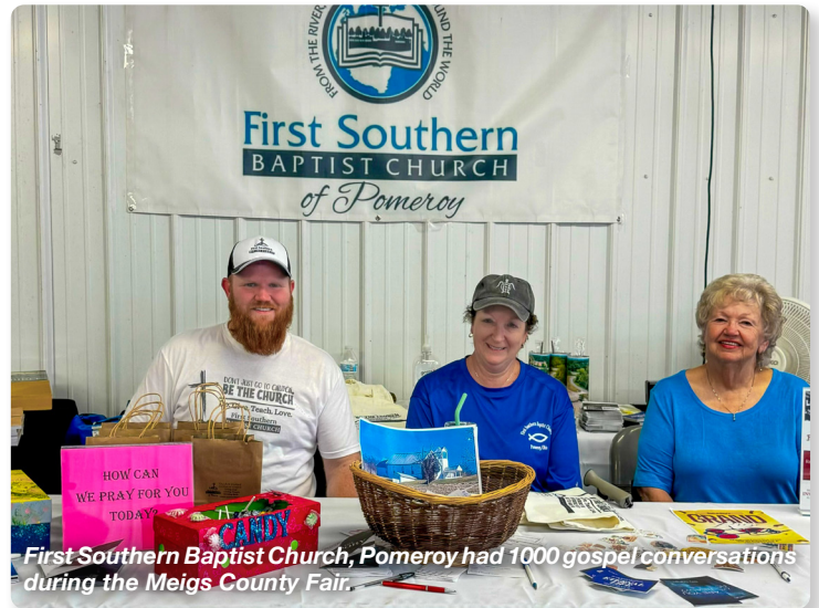
First Southern Baptist Church, Pomeroy had 1000 gospel conversations during the Meigs County Fair.

Here's what's really wild about this – just a year ago, FBSC was struggling. We were low in numbers, low in finances, and felt like we were barely hanging on.