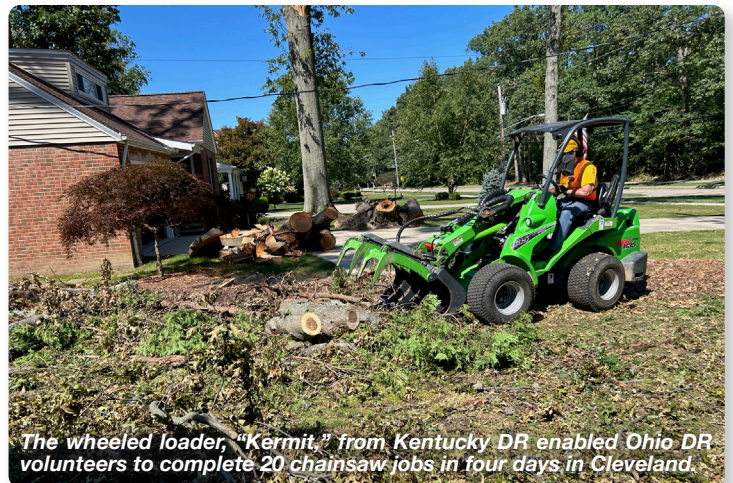
The wheeled loader, "Kermit," from Kentucky DR enabled Ohio DR volunteers to complete 20 chainsaw jobs in four days in Cleveland.