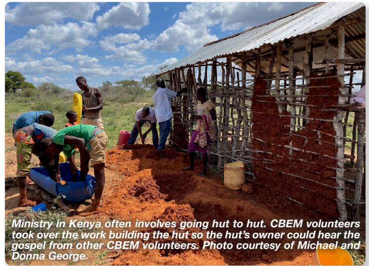
Ministry in Kenya often involves going hut to hut. CBEM volunteers took over the work building the hut so the hut's owner could hear the gospel from other CBEM volunteers.

"I could never have dreamed what has happened in Africa," he said. "Somehow God has made provision over the last eleven and a half years."