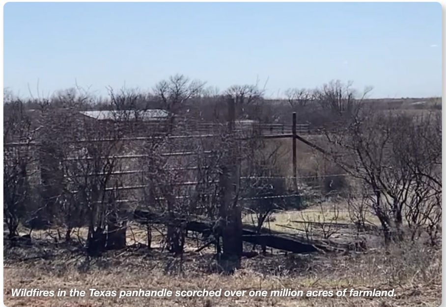
Wildfires in the Texas panhandle scorched over one million acres of farmland.

Later that same day, Tall called and shared that his company wanted to invest in the work of Disaster Re-