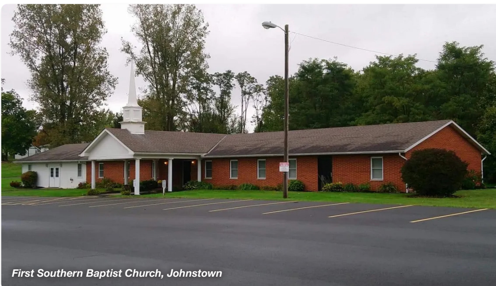
First Southern Baptist Church, Johnstown