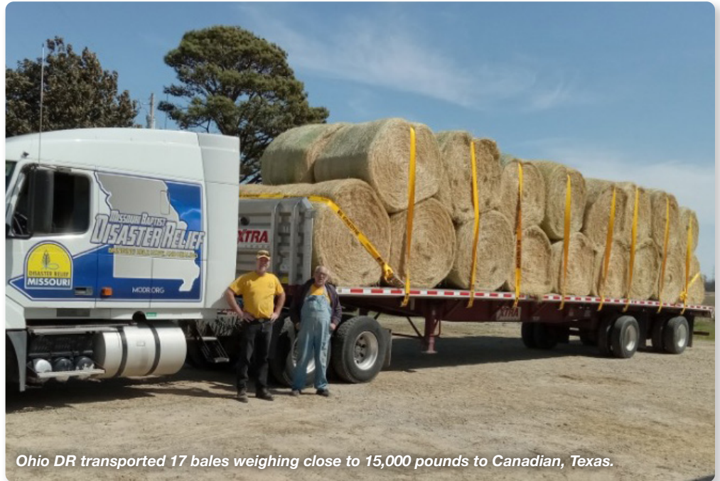
Ohio DR transported 17 bales weighing close to 15,000 pounds to Canadian, Texas.